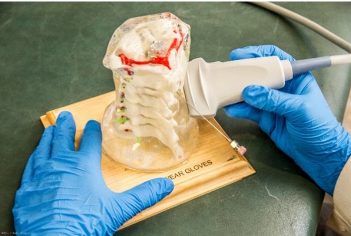
Cervical facet joint injection with ultrasound.

One of the special projects we are working on is creating alternative cervical, lumbar, and sacrum models for students to learn how to perform various medical procedures at a greatly reduced cost. The current models used by students can cost up to $6,000 dollars or more and replaced